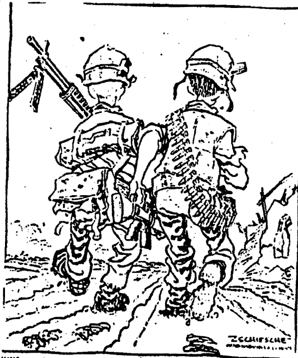
"Thought I'd go to a university on the GI bill when I get back, and live dangerously."